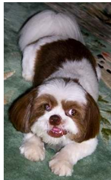
Tai at 22 months