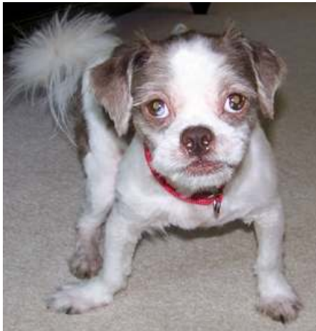
Tai at 11 months — 3 weeks in his new home

It was a long, tough journey from Spartanburg, but now, he’s happy, well adjusted, and simply enthusiastic about life, every day. Those who saw him in the beginning find it hard to believe that he’s the same dog and say, “He really is a miracle dog.”