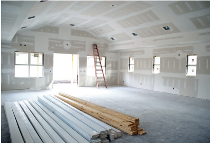
Pink Palace Under Construction