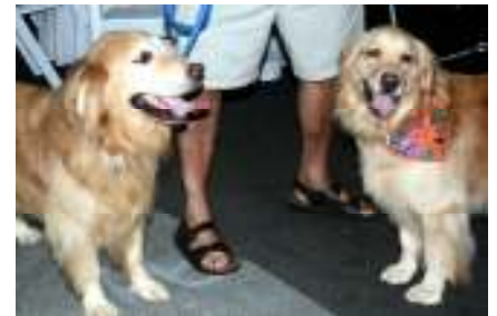
Bacardi and Mimosa